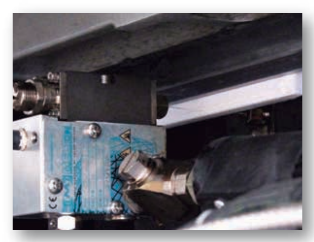
Applicators can be mounted to apply the adhesive to the book block (as shown) or to the cover feeder.

Valco Melton products offer a wide range of equipment solutions for side glue application. Whether contact or non-contact, electric or pneumatic guns, book block or a cover feeder application, Valco Melton has a solution to meet your specific needs.